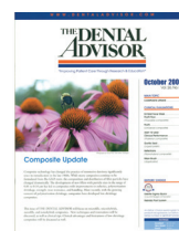
The Dental Advisor (Oct. 2009, Vol. 26 No. 8)