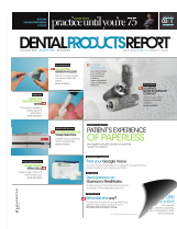
Dental Products Report (03/2012, Vol. 46)