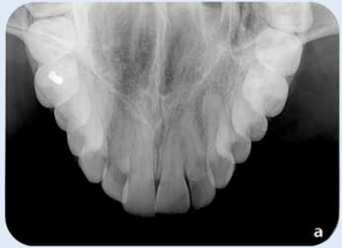
Occlusal - Size 4 PSP