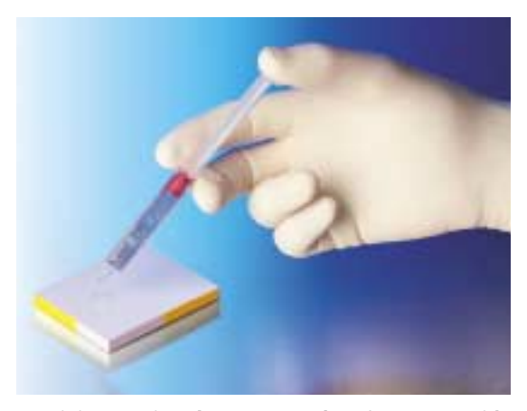
Precision, easier placement and performance with the Durelon® (CD) Calibrated Dispenser.

Durelon liquid is available in syringe-like Calibrated Dispensers for practitioners that prefer a powder and liquid version. Durelon Calibrated Dispenser delivers exact doses of liquid for increased control compared to bottled liquid systems.