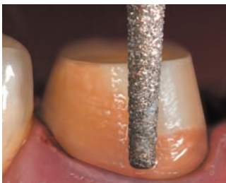
The exceptional workability of LuxaCore Dual produces more accurate preparations and results in perfect-fitting crowns, with no open margins.