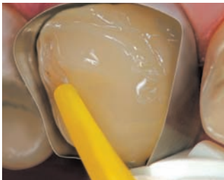
For convenient dispensing, LuxaCore Dual is available in no-mess 50 g Automix cartridges for use with the Type-25 1:1 dispensing gun, as well as easy-to-handle 9 g Smartmix® 1:1 handheld syringes.